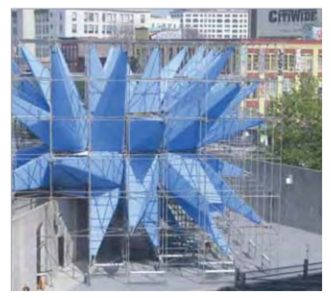
Figure 2. 'Wendy,' the winning design of MoMA's Young Architects Program in 2012. TiO<sub>2</sub> nanoparticles sprayed on its surfaces neutralize nitrogen dioxide air pollution

Researchers report a direct relationship between the photocatalytic activity of TiO<sub>2</sub> and UVA intensity.<sup>7</sup> One 2009 study examining photocatalytic action on organic vapors using commercially available TiO<sub>2</sub>-treated tile showed that decreasing UVA light intensity from 10 to 1 W/m<sup>2</sup> decreased photocatalytic efficiency to 15% of the original value.<sup>8</sup> This need for relatively intense UVA light exposure is a concern for indoor applications of photocatalytic technology. Because UVA is known to cause skin cancer and premature skin aging, domestic lighting products are currently designed and manufactured to minimize emissions in this range.