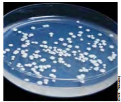
Figure 3. Bacterial colonies growing on an agar plate.

fixtures in a master bedroom/bath suite turned on. Under these conditions UVA intensity varied from 0.073 W/m<sup>2</sup> at the sink surface to 0.002 W/m<sup>2</sup> in a corner of the shower enclosure. Again, the UVA intensity levels were 2 to 4 orders of magnitude below those found in outdoor or high-intensity UV exposure applications. These measurements indicate that the levels of UVA lighting indoors can be weak and highly variable, even within the same room. Therefore, depending on photocatalytic technology activated by UVA light at levels that are not common or safe for indoor spaces is clearly a limitation and technical challenge.